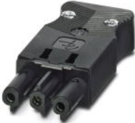
Socket for power supply and series connection, black, 3-pos.

Please be informed that the data shown in this PDF Document is generated from our Online Catalog. Please find the complete data in the user's documentation. Our General Terms of Use for Downloads are valid ( http://phoenixcontact.com/download )